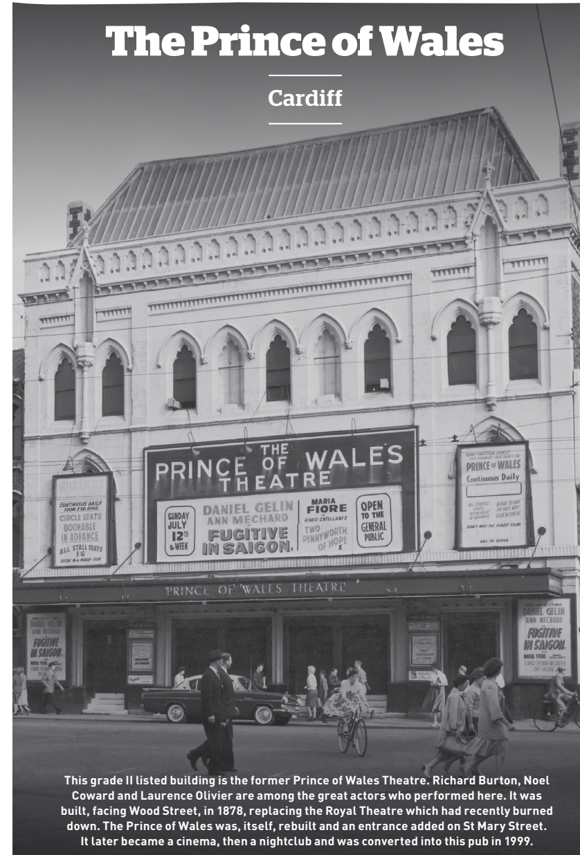
This grade II listed building is the former Prince of Wales Theatre. Richard Burton, Noel Coward and Laurence Olivier are among the great actors who performed here. It was built, facing Wood Street, in 1878, replacing the Royal Theatre which had recently burned down. The Prince of Wales was, itself, rebuilt and an entrance added on St Mary Street. It later became a cinema, then a nightclub and was converted into this pub in 1999.

Main menu 11.30am - 11pm. Children's menu available.