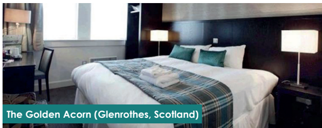
The Golden Acorn (Glenrothes, Scotland)