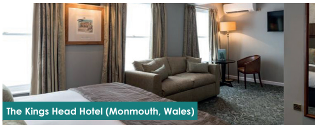
The Kings Head Hotel (Monmouth, Wales)