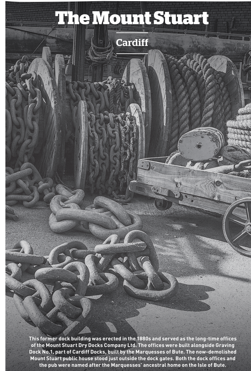
This former dock building was erected in the 1880s and served as the long-time offices of the Mount Stuart Dry Docks Company Ltd. The offices were built alongside Graving Dock No.1, part of Cardiff Docks, built by the Marquesses of Bute. The now-demolished Mount Stuart public house stood just outside the dock gates. Both the dock offices and the pub were named after the Marquesses' ancestral home on the Isle of Bute.

Main menu 11.30am - 11pm. Children's menu available.