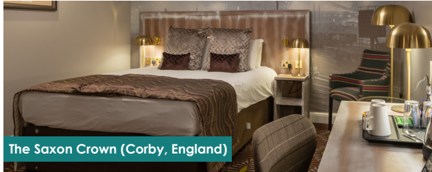
The Saxon Crown (Corby, England)