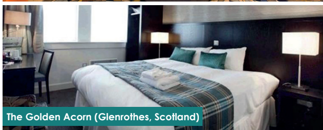
The Golden Acorn (Glenrothes, Scotland)