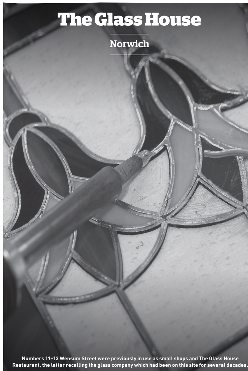
Numbers 11-13 Wensum Street were previously in use as small shops and The Glass House Restaurant, the latter recalling the glass company which had been on this site for several decades.

Main menu 11.30am - 11pm. Children's menu available.