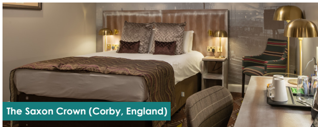
The Saxon Crown (Corby, England)

jdwetherspoon.com or the Wetherspoon app